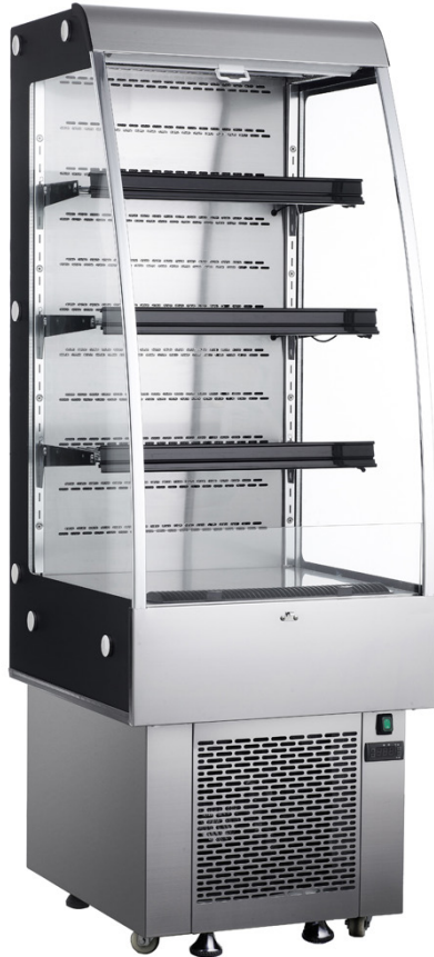
Great for Drinks, Fruits, Vegetables, Salads & Dairy